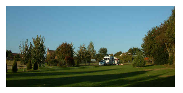
The site is open from March to End of October ADULTS ONLY. Charges per night are:

If you come from the South (Gt Yarmouth) on the A149 On entering North Walsham, drive straight on at traffic lights on to by-pass, carry straight on at next traffic lights and proceed as above *